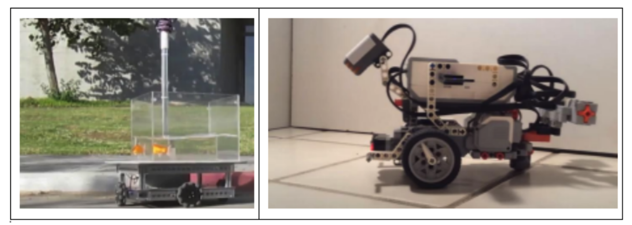
Figure 1: Left – Fish operated terrestrial navigation robot [88]; Right – Connectome of a worm is uploaded to a robot body and uses it to navigate its environment [84];

To provide some motivational examples, Figure 1 (left) shows domain transfer experiment in which a Carassius auratus is given a "fish operated vehicle" [83] to navigate terrestrial environment essentially escaping from its ocean universe and Figure 1 (right) shows a complete 302-neuron connectome of Caenorhabditis elegans uploaded to and controlling a Lego Mindstorms robot body, completely different from its own body [84]. We can speculate that most successful escapes would require an avatar change [85-87] to make it possible to navigate the external world.